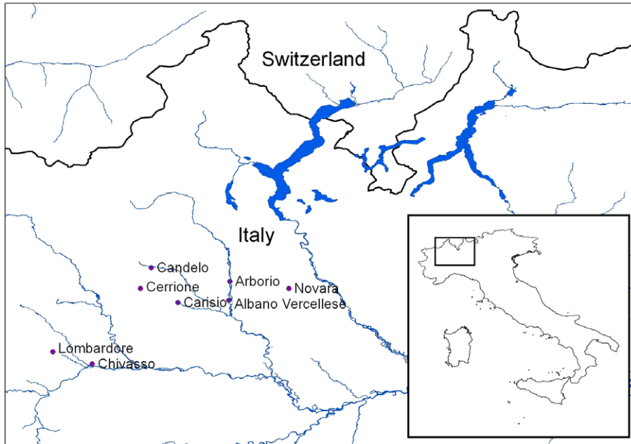
Fig. 2. Currently known localities of Juncus dichotomus in northwestern Italy.